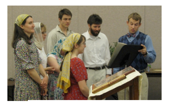
1: Student's make up the backbone of the choir

"Go therefore and make disciples of all nations, baptizing them in the name of the Father and of the Son and of the Holy Spirit, teaching them to observe all that I have commanded you..." (St. Matthew 28:19-20).