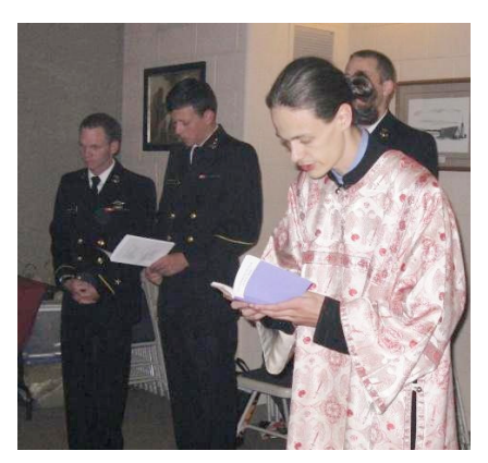
2: Bridegroom Matins during Holy Week

Christians. What do I believe? What is Truth? What is God's will for me? These are some of the big questions that many young people ponder in college. ACM is present on the campuses of Annapolis week in, week out , to minister to